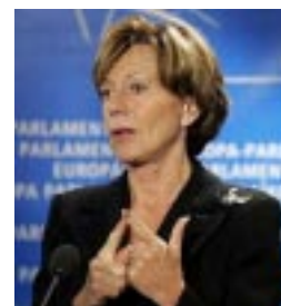
Neelie Kroes EU Competition Commissioner

'Now we need better joint working with Member States and the courts – that's my priority'